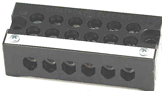
6 pole shown

1100 Series Deadfront Type 65 Amps, 600 Volts AC/DC