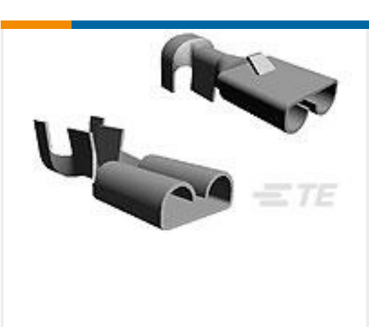
TE Part #160922-2 FF 110 REC 0.2-0.5MM2 TPBR