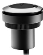
RAMO 30 F USB 3.0 or RJ 45 cable bushing