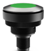
RAMO 30 T Pushbutton with stainless steel front ring