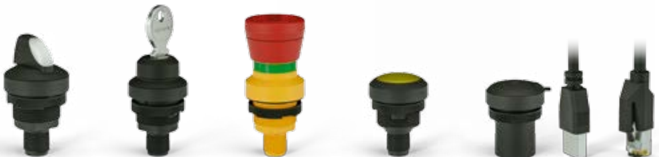
RAMO S Selector switch