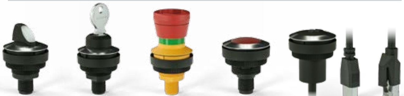
RAMO S Selector switch