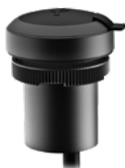
RAMO 22 F USB 3.0 or RJ 45 cable bushing