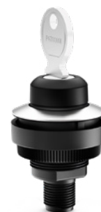
RAMO 30 K Keylock switch