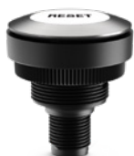
RAMO 30 T Pushbutton with FLEXLAB