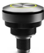
RAMO 30 T Pushbutton with stainless steel bezel and ring lighting