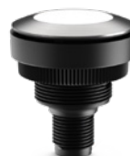
RAMO 30 I Signal lamp