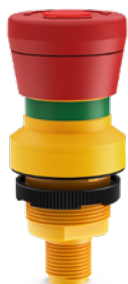
RAMO 22 E Emergency