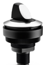
RAMO 30 S Selector