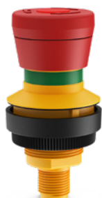
RAMO 30 E Emergency