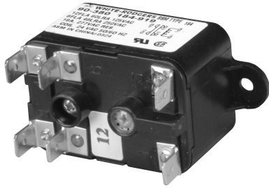
Totally Enclosed Relay Operates in Any Position Isolated Coil and Mounting Bracket