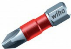
Phillips Terminator Impact Insert Bit 10 Pack