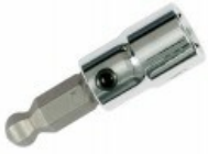
Ball End Hex Inch Bit Socket 1/4" Square Drive