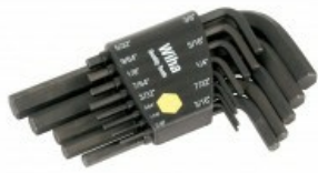
Hex Short Arm L-Key Black Inch 13 Piece Set