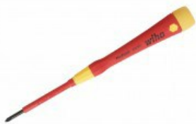
Insulated Phillips PicoFinish Screwdrivers