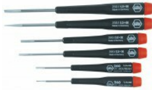
Precision Slotted Screwdrivers 6 Piece Set