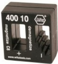
Magnetizer and Demagnetizer