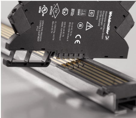
Power supply via the rail bus