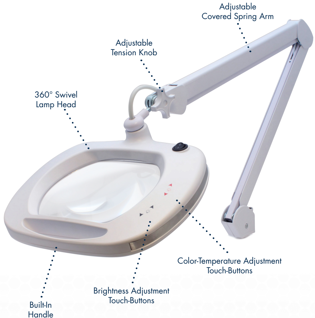
Adjustable Covered Spring Arm