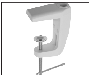
Heavy-Duty Mounting Clamp