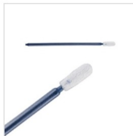
MICRO FOAM SWAB