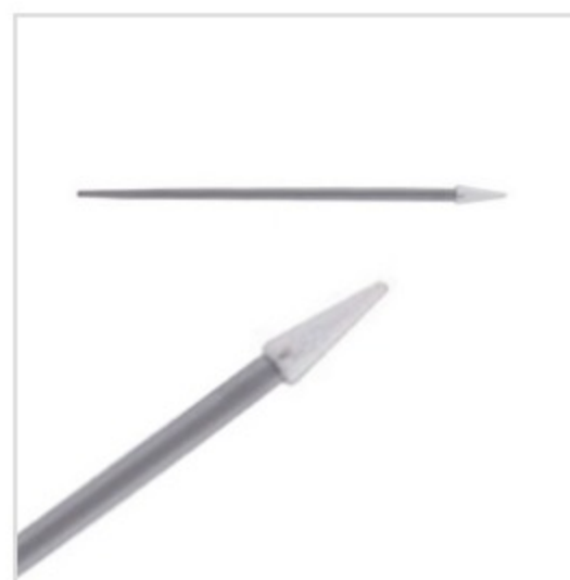
FOAM ARROW TIP SWAB