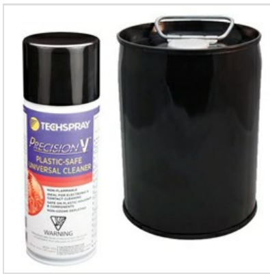
PRECISION-V PLASTIC-SAFE UNIVERSAL CLEANER