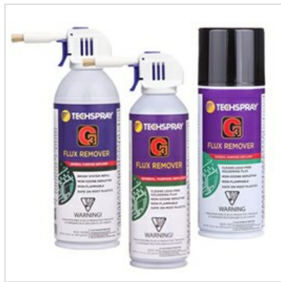
G3 FLUX REMOVER