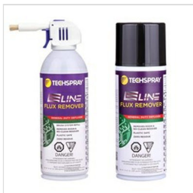
E-LINE FLUX REMOVER