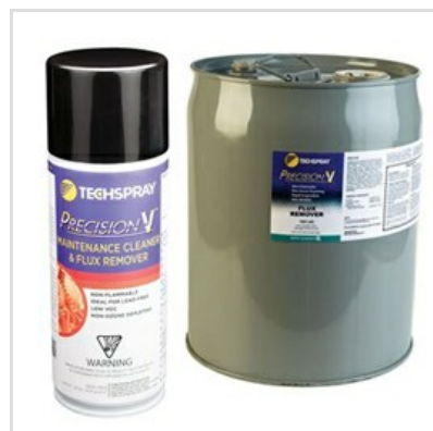
PRECISION-V FLUX REMOVER & MAINTENANCE CLEANER