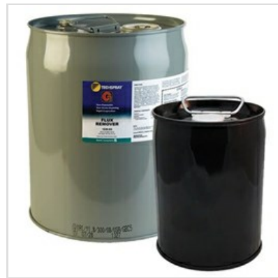
G3 UNIVERSAL CLEANER