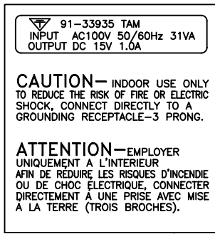
CAUTION LABEL BOTTOM CASE (SCALE:1/1)