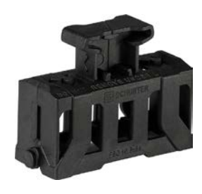
ESO 10.3x38 Fuse Inserter/Extractor with Cover Function for 10.3x38 \ mm Fuses in Clips, Patent Pending