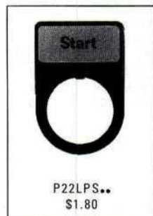
Plastic With Insert