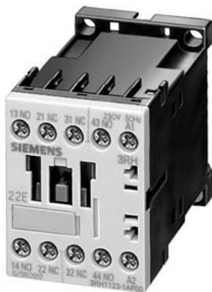
CONTACTOR RELAY, 3NO+1NC, AC 220 V 50 HZ / 240 V 60 HZ SCREW CONNECTION, SIZE S00