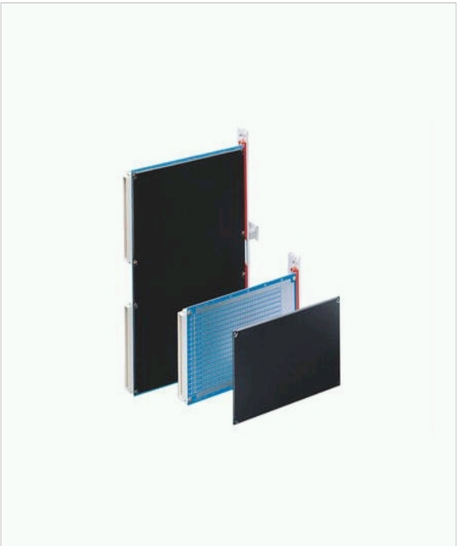
Diagram shows all fixing options for PCB bracket; Item 5c shows the product selected

CHANGING AN ITEM WILL UPDATE THE CATALOG NUMBER. THIS CAN AFFECT THE LIST PRICE AND SPECIFICATION OF THE ITEM.