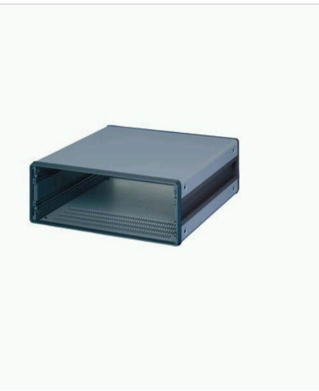
Extruded side panel

CHANGING AN ITEM WILL UPDATE THE CATALOG NUMBER. THIS CAN AFFECT THE LIST PRICE AND SPECIFICATION OF THE ITEM.