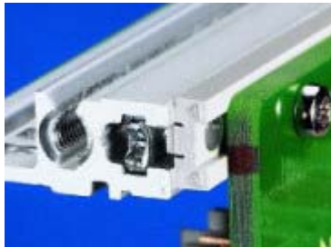
Indirect backplane mounting (with insulation strips)