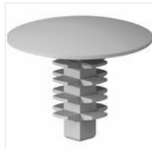
Fir Tree Rivet, Natural, .20 in Stem Length, .19 in Head Dia., .132 in Hole Dia., Type 6