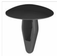
Mounting Buttons, Black, Nylon 6/6, 3.22 mm Max Hole, 2.0 mm - 2.5 mm Panel