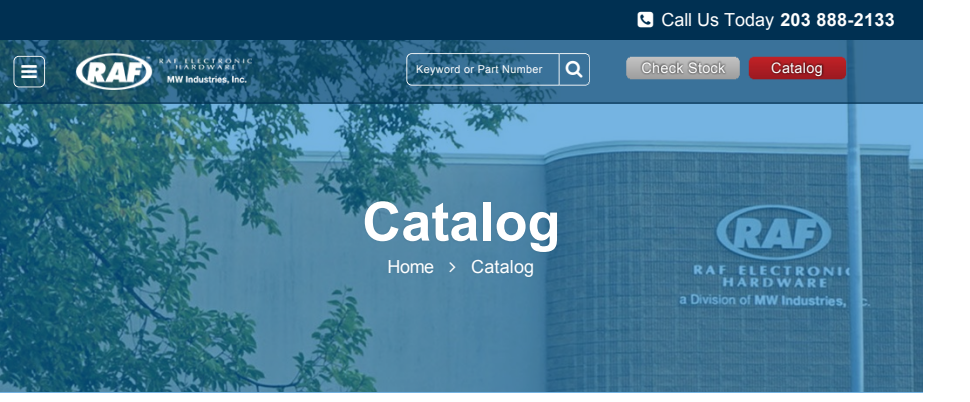
Home > 3065-B-440-B