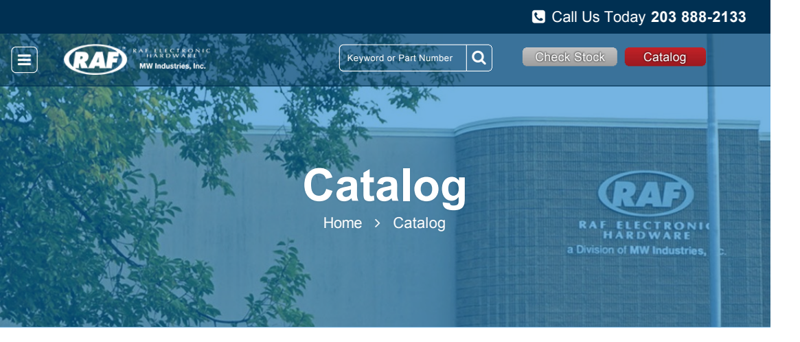
Home > 2189-440-AL