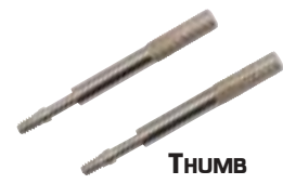
THUMB SCREW SET