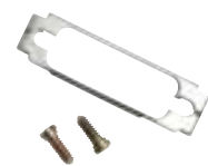
SLIDE LATCH KIT