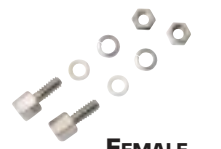
FEMALE SCREW LOCK