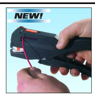
Semiautomatic Ferrule Crimping Tool CT-1000