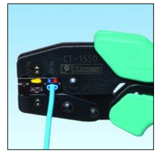
CONTOUR CRIMP™ Controlled Cycle Crimping Tools