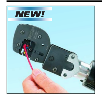
Battery Powered Crimping Tool CT-2500