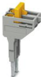
Switching jumper, Length: 21.2 mm, Width: 12.3 mm, Number of positions: 2, Color: gray/orange

Please be informed that the data shown in this PDF Document is generated from our Online Catalog. Please find the complete data in the user's documentation. Our General Terms of Use for Downloads are valid ( http://phoenixcontact.com/download )