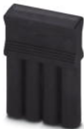
Short-circuit connector, Number of positions: 4, Color: black

Please be informed that the data shown in this PDF Document is generated from our Online Catalog. Please find the complete data in the user's documentation. Our General Terms of Use for Downloads are valid ( http://phoenixcontact.com/download )