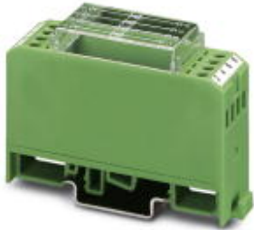
Diode module, with 4 diodes, individually wired, diode type 1N 5408

Please be informed that the data shown in this PDF Document is generated from our Online Catalog. Please find the complete data in the user's documentation. Our General Terms of Use for Downloads are valid ( http://phoenixcontact.com/download )