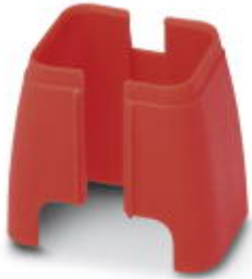
Security element for FL patch cable

Please be informed that the data shown in this PDF Document is generated from our Online Catalog. Please find the complete data in the user's documentation. Our General Terms of Use for Downloads are valid ( http://phoenixcontact.com/download )