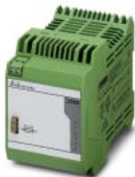
Power storage device, lead AGM, VRLA technology, 24 V DC, 0.8 Ah.

Please be informed that the data shown in this PDF Document is generated from our Online Catalog. Please find the complete data in the user's documentation. Our General Terms of Use for Downloads are valid ( http://phoenixcontact.com/download )