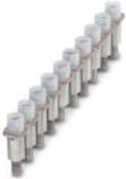
Fixed bridge, Number of positions: 10, Color: silver

Please be informed that the data shown in this PDF Document is generated from our Online Catalog. Please find the complete data in the user's documentation. Our General Terms of Use for Downloads are valid ( http://phoenixcontact.com/download )