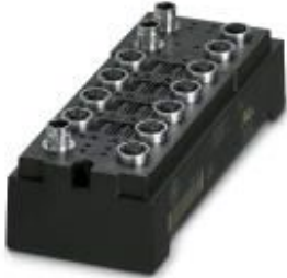
VersaMax IP modular device, 8 digital outputs of 500 mA each, M12 fast connection

Please be informed that the data shown in this PDF Document is generated from our Online Catalog. Please find the complete data in the user's documentation. Our General Terms of Use for Downloads are valid ( http://phoenixcontact.com/download )