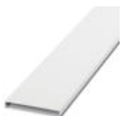
Cover for cable duct, white, width: 120 mm, length: 2000 mm

Cover profile - CD COVER 120 WH - 3240644