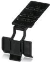
Universal wire holding bracket, perforated, for wiring channels

Please be informed that the data shown in this PDF Document is generated from our Online Catalog. Please find the complete data in the user's documentation. Our General Terms of Use for Downloads are valid ( http://phoenixcontact.com/download )