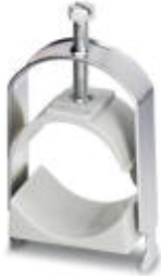
Cable clamp, for DIN rails

Please be informed that the data shown in this PDF Document is generated from our Online Catalog. Please find the complete data in the user's documentation. Our General Terms of Use for Downloads are valid ( http://phoenixcontact.com/download )