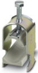
Cable clamp, for DIN rails

Please be informed that the data shown in this PDF Document is generated from our Online Catalog. Please find the complete data in the user's documentation. Our General Terms of Use for Downloads are valid ( http://phoenixcontact.com/download )