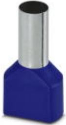
Ferrule, sleeve length: 16 mm, length: 31 mm, color: blue

Please be informed that the data shown in this PDF Document is generated from our Online Catalog. Please find the complete data in the user's documentation. Our General Terms of Use for Downloads are valid ( http://phoenixcontact.com/download )