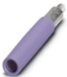
Female test connector, color: violet

Female test connector - PSBJ-URTK 6 VT - 3026421