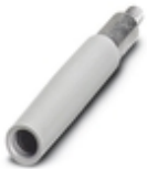
Female test connector, color: white

Female test connector - PSBJ-URTK 6 WH - 3026448