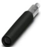
Female test connector, color: black

Female test connector - PSBJ-URTK 6 BK - 3026447