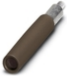
Female test connector, color: brown

Female test connector - PSBJ-URTK 6 BN - 3026971