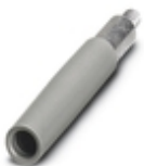
Female test connector, color: gray

Female test connector - PSBJ-URTK 6 GY - 3026612