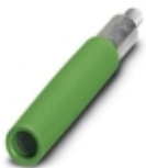
Female test connector, color: green

Female test connector - PSBJ-URTK 6 GN - 3026418