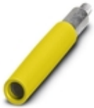
Female test connector, color: yellow

Female test connector - PSBJ-URTK 6 YE - 3026405