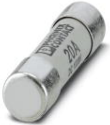
Fuse, 10.3x38 mm, up to 1000 V DC, gPV characteristics

Please be informed that the data shown in this PDF Document is generated from our Online Catalog. Please find the complete data in the user's documentation. Our General Terms of Use for Downloads are valid ( http://phoenixcontact.com/download )