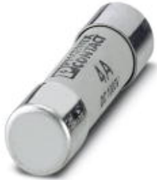
Fuse, 10.3x38 mm, up to 1000 V DC, gPV characteristics

Please be informed that the data shown in this PDF Document is generated from our Online Catalog. Please find the complete data in the user's documentation. Our General Terms of Use for Downloads are valid ( http://phoenixcontact.com/download )