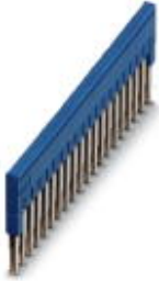
Plug-in bridge, pitch: 5.2 mm, number of positions: 20, color: blue

Please be informed that the data shown in this PDF Document is generated from our Online Catalog. Please find the complete data in the user's documentation. Our General Terms of Use for Downloads are valid ( http://phoenixcontact.com/download )