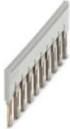
Plug-in bridge, pitch: 8.2 mm, width: 80.3 mm, number of positions: 10, color: gray

Please be informed that the data shown in this PDF Document is generated from our Online Catalog. Please find the complete data in the user's documentation. Our General Terms of Use for Downloads are valid ( http://phoenixcontact.com/download )