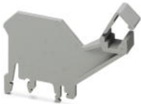
Support bracket, Number of positions: 1, Width: 2 mm, Color: gray

Please be informed that the data shown in this PDF Document is generated from our Online Catalog. Please find the complete data in the user's documentation. Our General Terms of Use for Downloads are valid ( http://phoenixcontact.com/download )