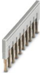
Plug-in bridge, pitch: 6.2 mm, width: 60.3 mm, number of positions: 10, color: gray

Please be informed that the data shown in this PDF Document is generated from our Online Catalog. Please find the complete data in the user's documentation. Our General Terms of Use for Downloads are valid ( http://phoenixcontact.com/download )