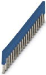
Plug-in bridge, pitch: 6.2 mm, width: 122.3 mm, number of positions: 20, color: blue

Please be informed that the data shown in this PDF Document is generated from our Online Catalog. Please find the complete data in the user's documentation. Our General Terms of Use for Downloads are valid ( http://phoenixcontact.com/download )