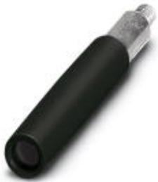
Female test connector, color: black

Please be informed that the data shown in this PDF Document is generated from our Online Catalog. Please find the complete data in the user's documentation. Our General Terms of Use for Downloads are valid ( http://phoenixcontact.com/download )