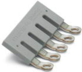
Insertion bridge, pitch: 9 mm, number of positions: 5, color: gray

Please be informed that the data shown in this PDF Document is generated from our Online Catalog. Please find the complete data in the user's documentation. Our General Terms of Use for Downloads are valid ( http://phoenixcontact.com/download )