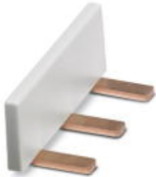
Insertion bridge, pitch: 17.8 mm, number of positions: 3, color: light gray

Please be informed that the data shown in this PDF Document is generated from our Online Catalog. Please find the complete data in the user's documentation. Our General Terms of Use for Downloads are valid ( http://phoenixcontact.com/download )